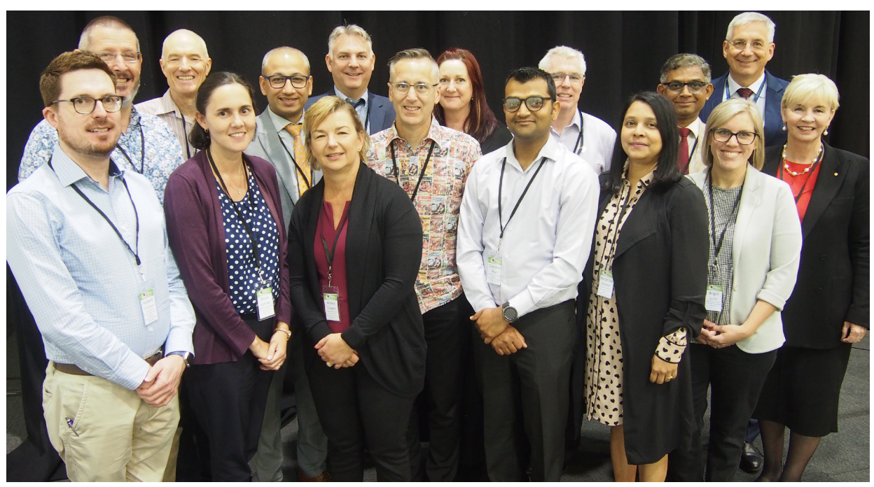
Statewide Clinical Network Chairs