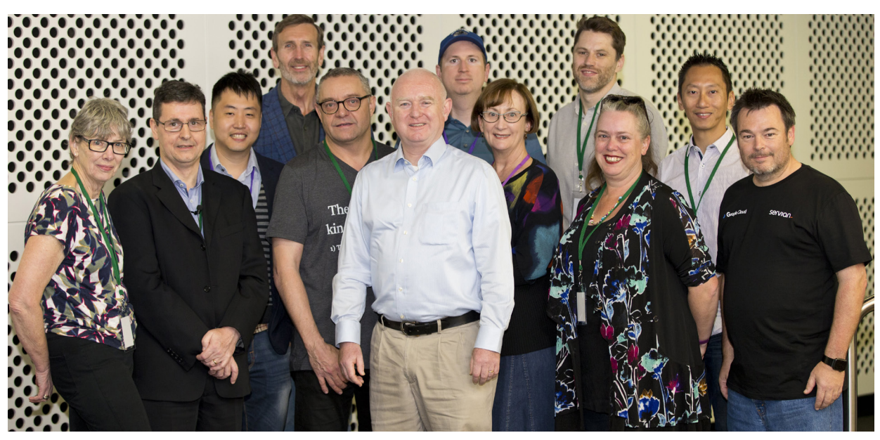
Intensive care unit datathon opening