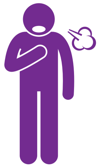
1 rapid breathing