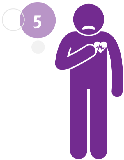
5 rapid heart rate