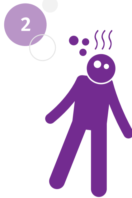
2 new onset confusion or altered consciousness