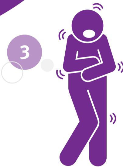
3 fever or hypothermia